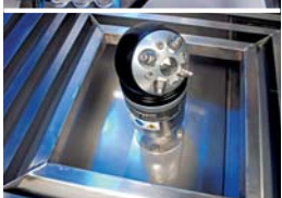
Three-dimensional high pressure internal cleaning head