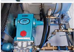
High pressure pump with ceramic cylinders