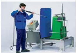
Manual external cleaning